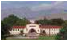
New Mexico State University