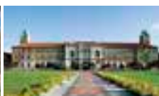
Texas Tech University