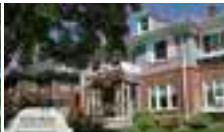
Idaho State University