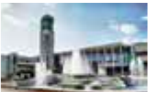
Missouri State University