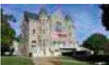
Virginia Union University