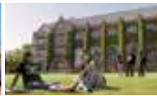
University of Idaho