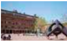
Western Washington University

These universities grant academic credit to students enrolled at them and can also grant transfer academic credit to students from other colleges who apply to the KCP program through them.