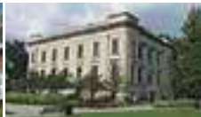
Indiana State University