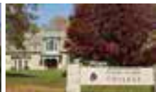
Rhode Island College